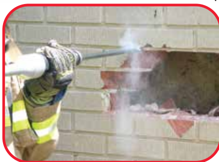
Breaching Brick and Block