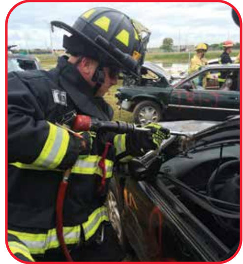
Cutting "A" Post

Ajax special cutting chisels are manufactured from the highest quality alloy steels and are made specifically for gaining fast entry into wrecked automobiles. Even though these chisels look similar to those found in many body shops and supply stores, don't be fooled! Only Ajax gives you the cutting edge needed for consistently fast extrication work.