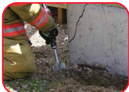
Spade bit for digging and trenching