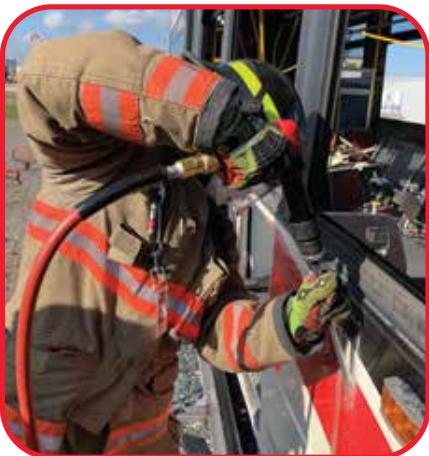
Ajax 911-RK "Only Ajax Cuts The Bus"

Every Ajax Air Hammer Rescue Kit is completely portable, compact and lightweight. They can be operated with air tanks, compressors, nitrogen bottles, cascade systems or air brake outlets and may be used with both 2216 psi and 4500 psi air tanks.