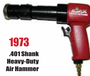
1973 .401 Shank Heavy-Duty Air Hammer

811-RKM Same as 811 RK with (#1985) 1/2-in. Impact Wrench and #1986 11-piece (fractional) socket set.