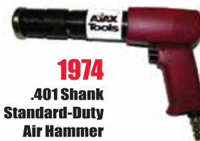
1974 .401 Shank Standard-Duty Air Hammer

711-RKM Same as 711 RK with (#1985) 1/2-in. Impact Wrench and #1986 11-piece (fractional) socket set.