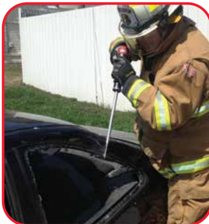
Cutting "C" Post

Every kit includes an Ajax Kwik Change Retainer. This retainer was originally developed by Ajax to hold the cutting chisel securely in place, yet allowing you to change chisels in a matter of seconds during emergency procedures. In addition, the retainer also allows the use of Ajax Exclusive non-turn chisels. These chisels can be indexed into different positions to allow one-hand operation of the hammer when necessary. The Ajax Kwik Change Retainer is the only retainer which lets you use both turn and non-turn type chisels.