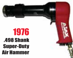
1976 .498 Shank Super-Duty Air Hammer

911-RKM Same as 911 RK with (#1985) 1/2-in. Impact Wrench and #1986 11-piece (fractional) socket set.