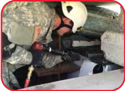
Cutting through dryer in collapse

S ince 1946, Ajax Tool Works, Inc. has been recognized as one of America's finest quality manufacturers of hand and power tool accessories. In discovering a need for our particular type of cutting tools, Ajax Rescue Tools became a pioneer in the field of emergency extrication tools, introducing our first air hammer rescue kit over 50 years ago. From this single kit has grown a complete line of rescue tools designed to meet the challenges in auto extrication, forcible entry, structural collapse, tunneling, confined space, trench rescue, mining collapses, and other emergency situations with the speed, portability and dependability you need when every second counts.